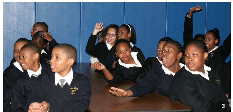
1.) Candidates in their mini election.

For more information about the Vote 18 program or guiding a group of children you know to holding their own voters' registration drive, please contact jglick@jeremysheroes.org . jh