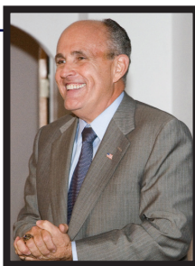
Our host laughs along with JH guests during a lively discussion