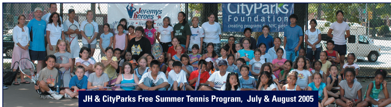
JH & CityParks Free Summer Tennis Program, July & August 2005